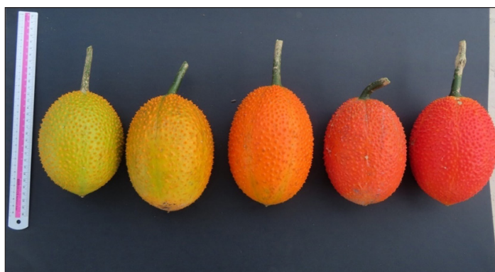
Figure 2. Gac fruits with different maturity index

The gac fruits, manually harvested at maturity index 4, had bright and vivid orange-red peel colors, with vibrant orange to reddish-orange skin, bright red or deep orange pulp, and a firm but slightly yielding texture. The fruits are harvested at maturity stage four because this stage represents the optimal point for several important physicochemical properties (Tran et al., 2016). At this stage, the gac fruit exhibits the highest levels of beneficial compounds, such as lycopene and beta-carotene, which are important for their antioxidant properties. The texture is also ideal for processing and consumption. Harvesting at this stage ensures the best nutritional content, flavor, and texture quality, making it suitable for fresh consumption and further processing. Additionally, data on the number of fruits per plant were recorded daily and summed up during the harvesting period.